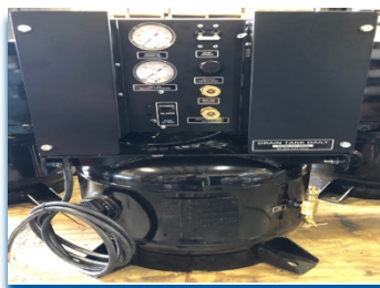
NBRU Portable Stacked Units Customer: Time Manufacturing

PSI won this business over seasoned competitors and delivered a first-class product described as innovative and in a class all its own. Working closely with the client's product development team, PSI provided a solution that met all of the client's goals. From concept to production, PSI surpassed the clients' expectations and delivered an extraordinary product.