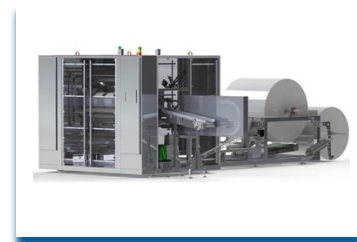
Disinfectant Wipes Production NEW LINE: COVID PIVOT

PSI designed a custom portable replacement for nitrogen bottles for installation into utility trucks to run dry air buffering and pneumatic tool applications. The unit was designed to provide safety and cost savings for the client. This unit is currently used on AT&T, Verizon, and Quest utility vehicles.